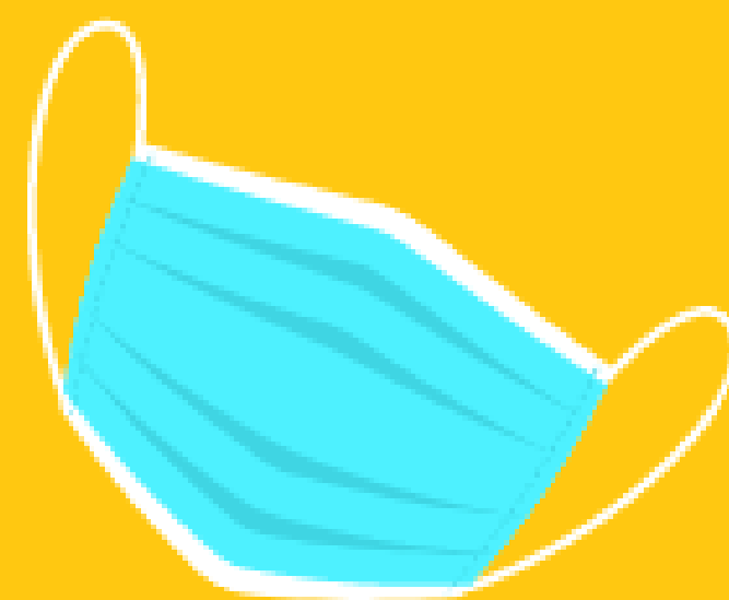
Pack of Masks