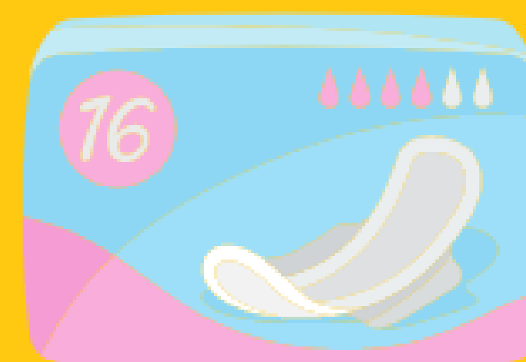
Pack of Sanitary napkins