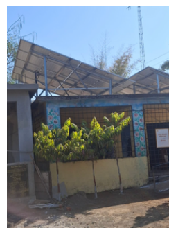
CCDT installed solar panels and an IT lab at Uprale Zilla Parishad School in Vikramgad, ensuring reliable power and digital learning opportunities for students from tribal communities.