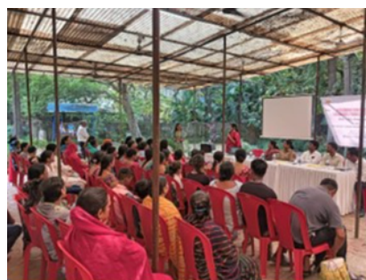
Dissemination of findings of Community Led Child Protection Project in Dahisar