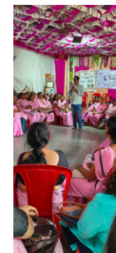
Training of frontline health workers (AWW, ASHA) on Adolescent health- 2 training- 93 participants