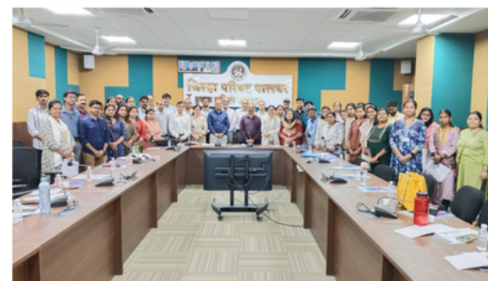
Training of Doctors from Sub-Centre, District hospital, Rural Hospital on Preventive Neonatology in collaboration with Zilla Parishad Palghar and Indian Academy of Pediatrics- 32 participants