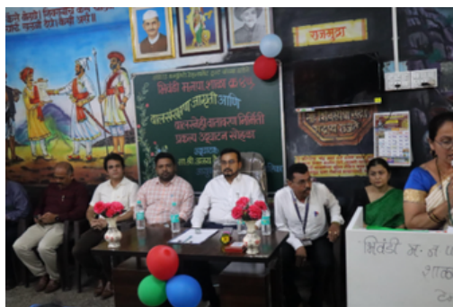
Launch of Child Protection Program in Government Aided Schools