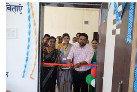
Launch of Adolescent Friendly Health Corner in Sub-centre in Bhiwandi