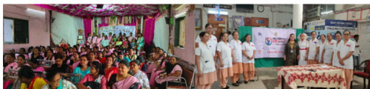
Training of frontline health workers (AWW, ASHA) on Prohibition of Child Marriage Act, 2006 and Strengthening of Child Protection Committee : 3 trainings- 304 participants