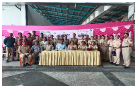
Capacity Building of GRP, RPF, Ticket Checkers, and Railway Vendors on Preventing Child Trafficking and Strengthening Child Protection Laws in collaboration with government departments- 4 trainings- 224 participants