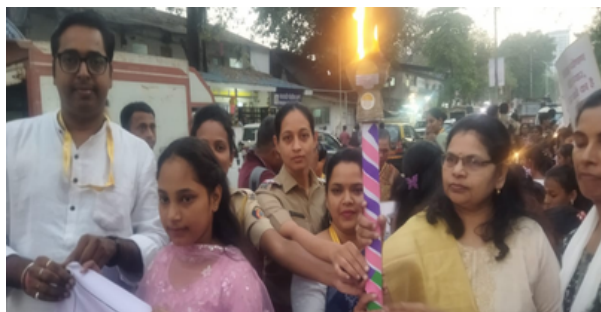
Bal Vivah Mukta Bharat Rally

"Aao Baat Karein – Ek Nayi Shuruwat," a CCDT initiative, provides adolescents a safe space to share ideas and concerns, engaging over 300 participants from Mumbai's urban slums.