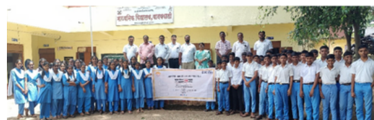
Training of School Management and teachers on child protection and child rights- 5 trainings- 750 participants